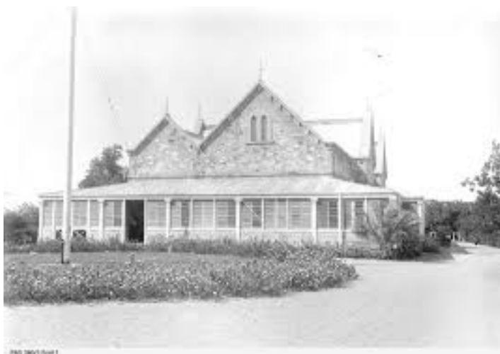
Government House, post 1910.

What was first known as The Residency commenced construction in 1870 with a central stone hall and cellar. It was originally a two storey residence in 1874 but by 1878, the second storey was considered unsafe, so the building was modified. By 1910, the verandah was enclosed by thatch shutters and before 1960, the verandah had its shutters replaced by asbestos louvres. 1 Since then the "House of Seven Gables" has had further modifications with the most recent being a new high fence at the entrance replacing the beautiful white picket fence. The building has withstood the Bombing of Darwin and Cyclone Tracy and hosted a multitude of dignitaries including Queen Elizabeth, Prince Charles and Lady Diana. Government House celebrated its milestone with two public openings this week.