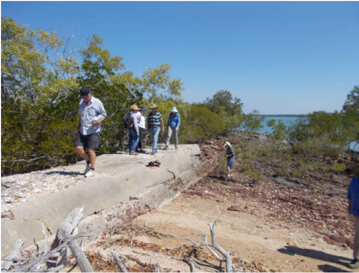
The stone and concrete jetty