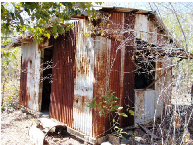
Corrugated iron hut

The site is very overgrown with only a couple of corrugated iron huts still standing. Two sweet possums had made their home in one of them. Foundations of buildings were still very visible with several sets of stairs that led to nowhere. The jetty had been built with stone and covered in concrete but much of the concrete had crumbled away. Metal beds, chairs and cabinets were scattered in the bush. A pleasant find was a beautiful stone and brick fire place complete with chimney.