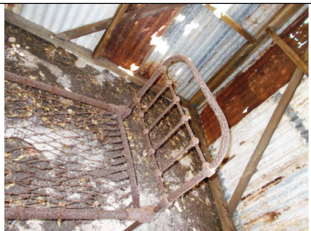
Metal bed inside the hut