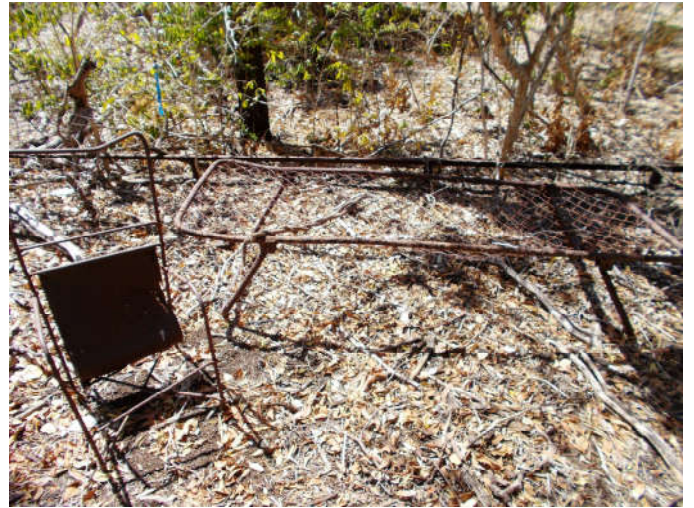
Metal chair and bed