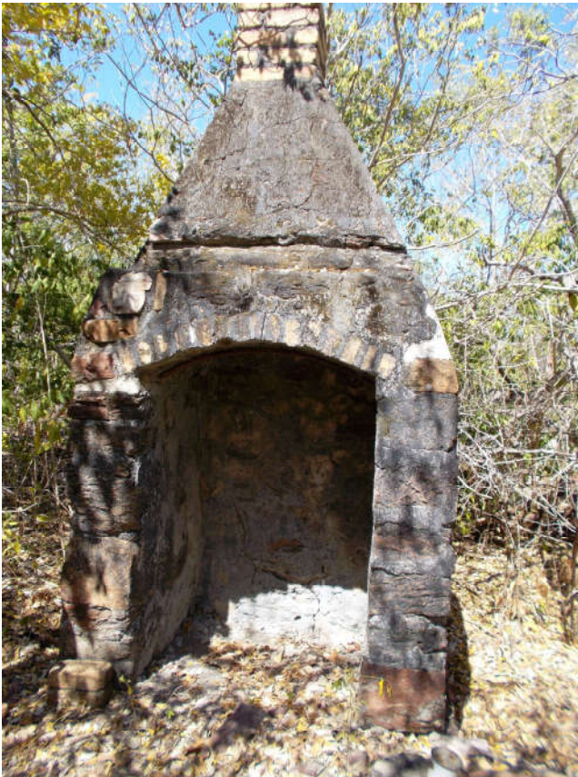
Stone and brick fire place