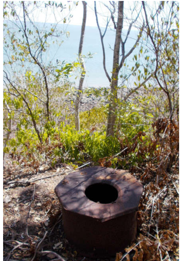
Metal toilet - flaming fury with a sea view